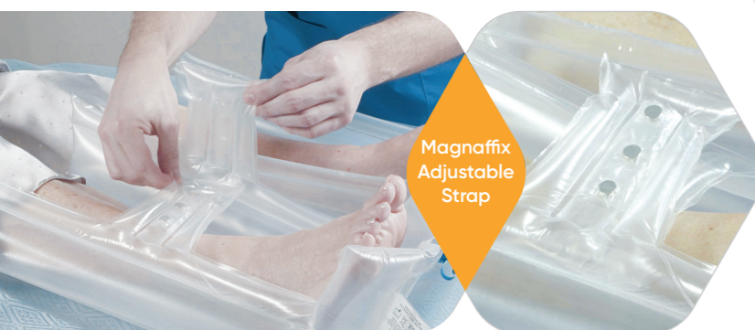
Magnaffix Adjustable Strap